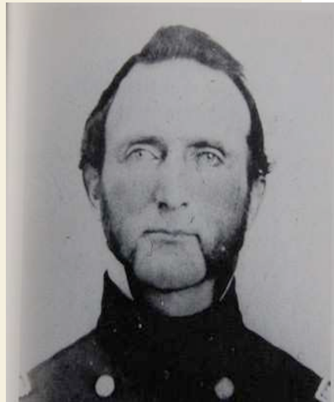
THOMAS "STONEWALL" JACKSON

and related activities will begin June 8th. On that day there will be both walking and trolley tour around Clarksburg and near-by areas. There will be A souvenir map will be available to guide visitors to the remaining original sites and areas that are no longer existing. There will be special musical presentations in various places, the HCHS house, as well as our Flag exhibit at the Waldomore. The exhibit will remain in the Waldomore for two weeks. At that time, our splendid 5 ft X 8 ft., restored 1863 flag will be on exhibit along with a variety of Civil War artifacts and photographs. The flag will eventually tour the county to be on display at various venues. HCHS will need to have a special stand constructed on which to safely display the flag to its best advantage. HCHS wishes to establish a special fund for building this display unit. Contributions or a sponsor would be appreciated.